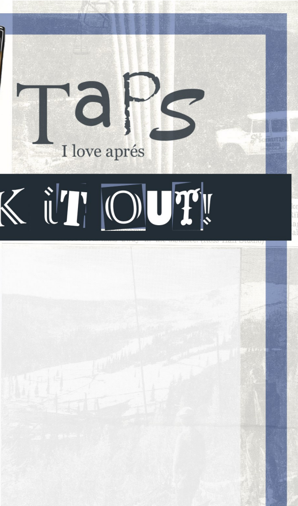
TWO EXPLORERS look out over Schweitzer Basin from the north after an early snowfall. The day lodge and lower lift station appear dimly in the lower left-center.

Another curious development in the Arctic ski is that it was often covered with animal fur.